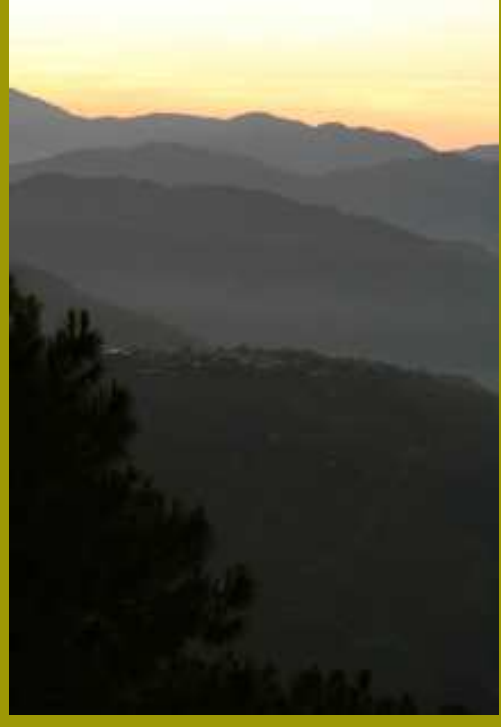
Baguio, Philippines (2007). Interspersed within the politics of survival is the priceless beauty for those who care to gaze responsibly at nature.