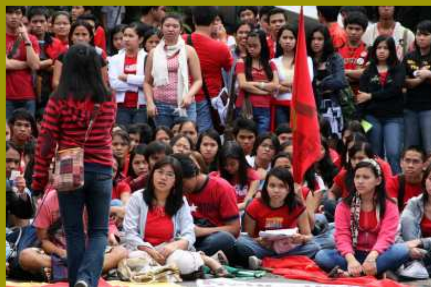
Cultural arts, like music, dance and songs, are commonly used in indigenous peoples' protest actions.