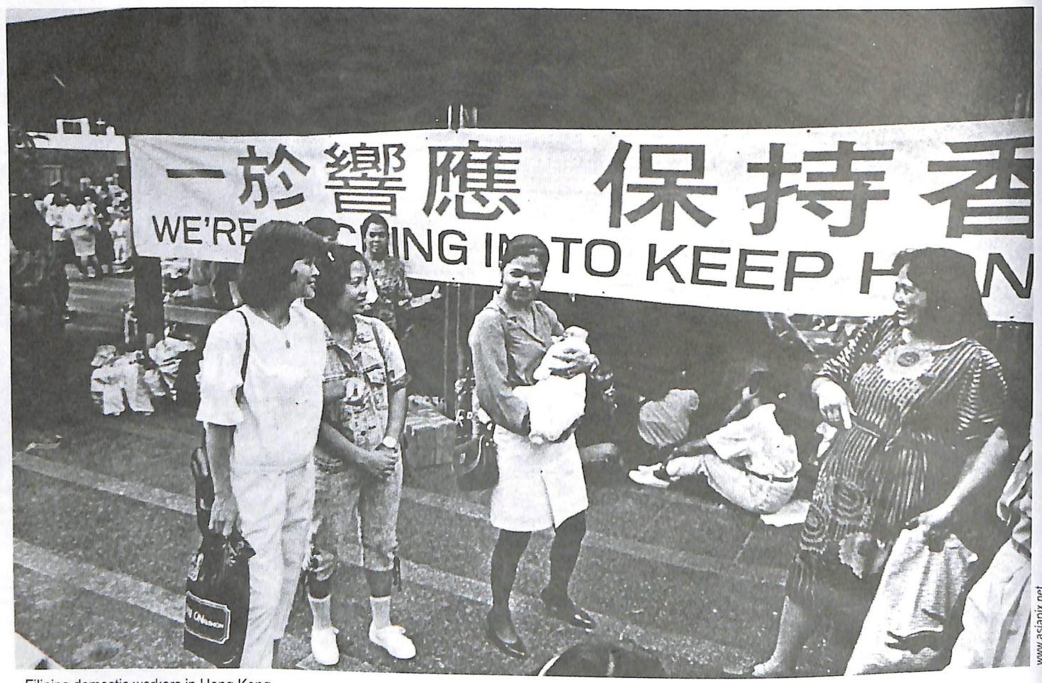
Filipina domestic workers in Hong Kong