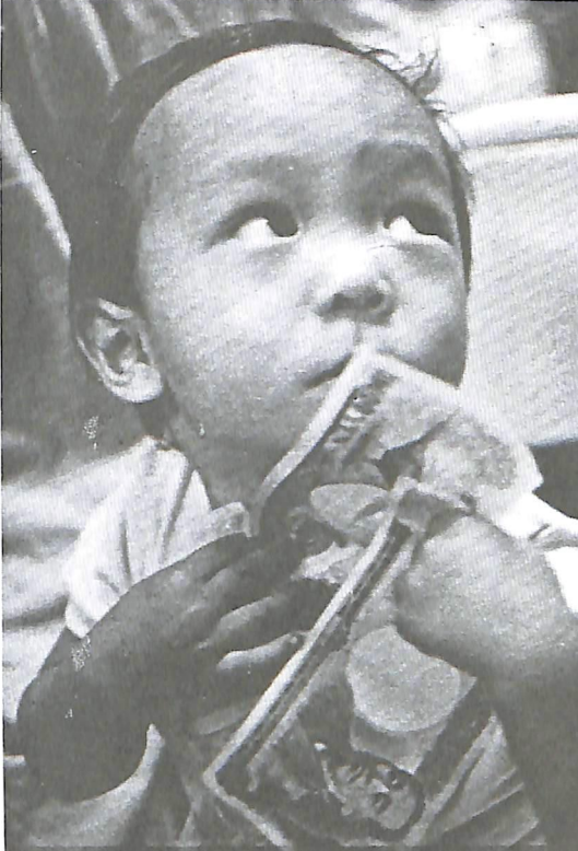
A Japanese-Filipino child—Children of mixed parentage suffer from discrimination in Japan.

ers, of mixed parentage (from mixed marriages and rapes) was something that was never considered by host and sending governments when they embarked on large-scale trade in human labour. After only 15 to 20 years, there has emerged a serious consequence and a compelling reality that governments and societies must reckon with. This is the increase in the number of children of mixed marriages. <sup>12</sup>