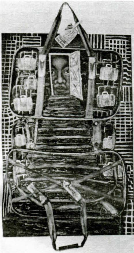
Imelda Cajipe-Endaya Bagahe sa Refugee House