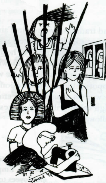
Yvonne Lin Mei-jung

There are ten tribes of aboriginals in Taiwan who speak 13 different languages. The lands formerly used by them to cultivate crops are now being used as national parks, experimental forest areas for universities, farms for retired servicemen of Chiang Kai-shek's army and golf courses. Owing to the shrinkage of their lands, the agricultural and hunting societies of the tribals have collapsed. Young girls, women and men are forced to come to the cities to look for jobs. Only the elderly and children under the age of 12 remain in the villages. Some primary school graduates are forced to work as prostitutes even if they are below the minimum age to work legally. They are sent to the owners of brothels, where they are injected with hormones and fed chicken soup so they will develop faster and be used by male customers. According to Chinese tradition, a man who has intercourse with a virgin will live ten years longer.