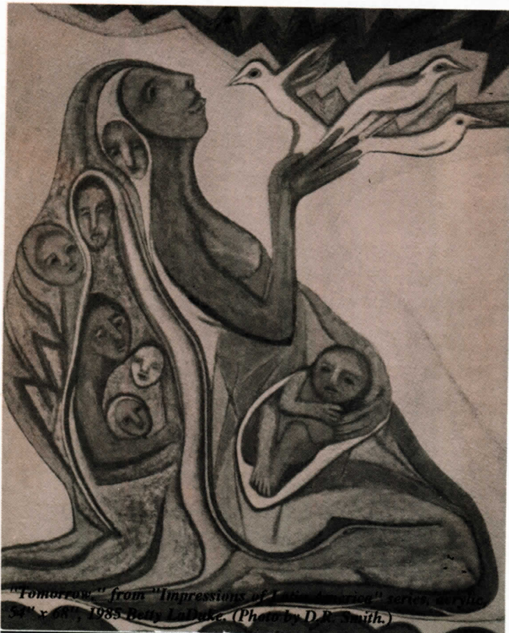
"Tomorrow" from "Impressions of Latin America" series, 54" x 60", 1985 Betty LaBake.