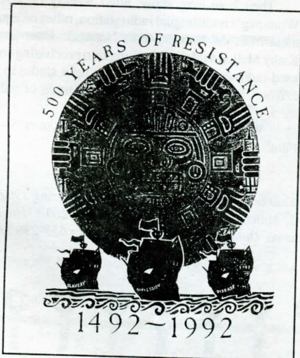
Design by Paul Aston