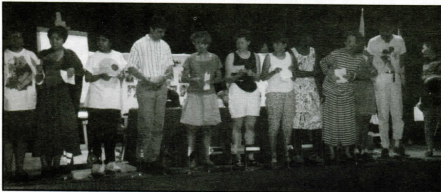
Forty participants from various women and youth organizations attended the 6-day seminar

The plenary topics were images and fears of women in the north and south, and women in development. Aside from the plenary sessions, workshop discussions, video presentations, simulation games and social activities allowed full interaction and sharing of experiences among the speakers and participants. For many of the youth participants, the seminar provided them the first opportunity to discuss women in relation to issues of development.