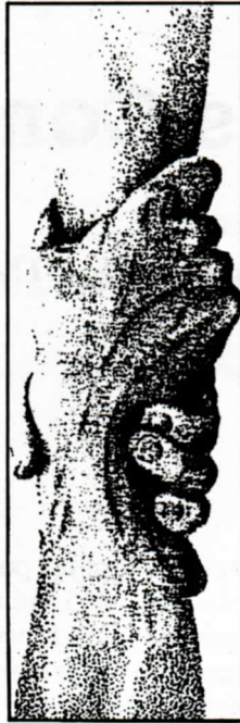
Correspondencia #10 1991